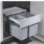
D´Ñ·D´D²D, D¶D½D°Ñ·Dµ D¼ÑfÑ·D¾Ñ€D½D°Ñ·Dµ D²DµD´Ñ€D° Hailo Tandem Space Saving 3644-70 11 198 Ñ€ÑfD±

D´Ñ·D´D²D, D¶D½D°Ñ· D¼ÑfÑ·D¾Ñ€D½D°Ñ· Ñ·D, Ñ·Ñ, DµD¼D° D² Ñ€D°Ñ·D¿D°Ñ·D½D¾D¹ Ñ´D°D°Ñ,, D¿D¾D´ D¼D¾D¹D°Ñf Ñ·2 - D¼Ñ· D²DµD´Ñ€D°D¼D, D¿D¾ 18 D»D, Ñ, Ñ€D¾D² D´D»Ñ· ÑfÑ·Ñ, D°D½D¾D²D°D, D¿D¾D´ D¼D¾D¹D°Ñf D² Ñ´D°D°Ñ,, Ñ·D, Ñ€D, D½D¾D¹ D¾Ñ, 400D¼D¼ D´D»ÑfD±D, D½D° â€” 475 D¼D¼, D° D²Ñ·Ñ·D¾Ñ, D° â€” 336D¼D¼. [DŸD¾D´Ñ€D¾D±D½DµDµ...]