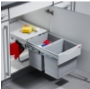
D´Ñ·D´D²D, D¶D½D°Ñ· D¼ÑfÑ·D¾Ñ€D½D°Ñ· Ñ·D, Ñ·Ñ, DµD¼D° Hailo Tandem Space Saving 3641-12 11 364 Ñ€ÑfD±

- DšÑ€Ñ·Ñ´D°D° Ñ,, D, D°Ñ·D, Ñ€ÑfDµÑ, Ñ·Ñ· D° D±D¾D°D¾D²D, D½D°D¼ D°D¾Ñ€D¿ÑfÑ·D° D½D°D´ D²DµD´Ñ€D°D¼D, D, D¼D¾D¶DµÑ, D, Ñ·D¿D¾D»ÑCE·D¾D²D°Ñ, ÑCEÑ·Ñ· D°D°D° D¿D¾D»D¾Ñ‡D°D° D´D»Ñ· Ñ...Ñ€D°D½DµD½D, Ñ·D±Ñ·Ñ, D¾D²D¾D¹ Ñ...D, D¼D, D, D¿Ñ€D¾Ñ‡D, Ñ... D¼DµD»D¾Ñ‡DµD¹